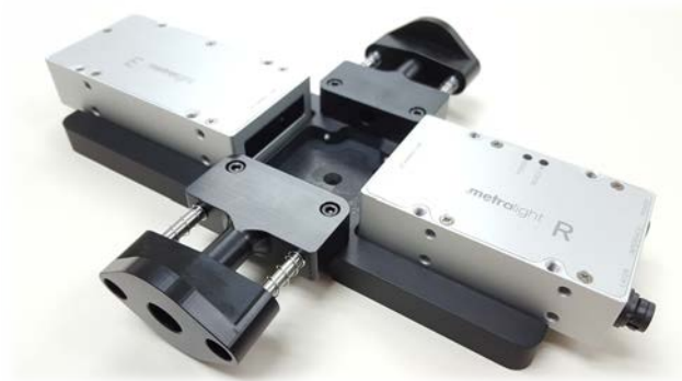
FIGURE 1: P4350 MX2 Laser Micrometer Assembly