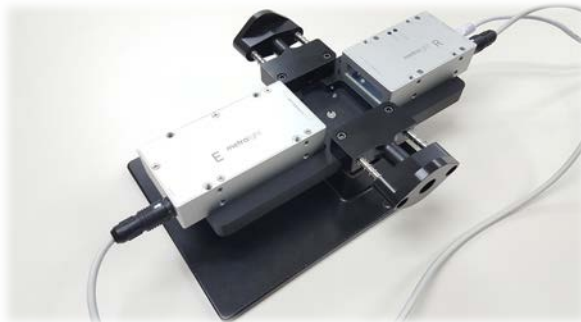
FIGURE 2: P4350 Laser Micrometer (before mounting)

NOTE: Do not remove the laser micrometer emitter or receiver from the P4330 Hot-swappable Baseplate for any reason! Doing so will require shipment back to the manufacturer for alignment and calibration. The system should be maintained and cared for in place.