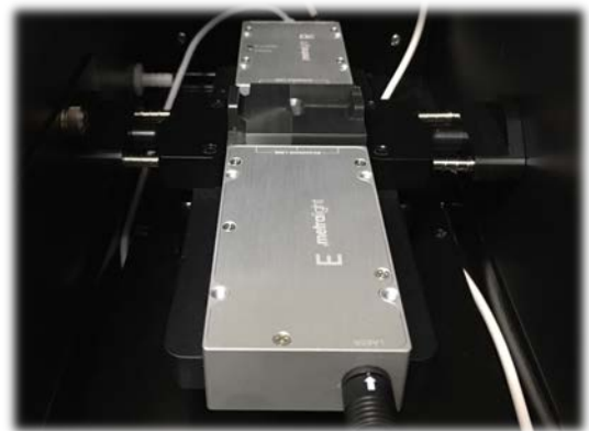
FIGURE 3: P4350 Laser Micrometer (mounted inside the Evo 220)