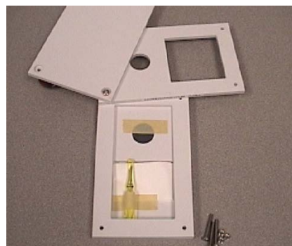
FIGURE 3 (alternative method, standard phantom)

(Alternative method for P1010 standard dosimeters such as ceric-cerous or dichromate ampoules or PMMA: Place the dosimeter ampoules into the square well and the alanine transfer dosimeter into the circular well. Secure all dosimeters in place so that they do not shift during irradiation. See Figure 3 below.)